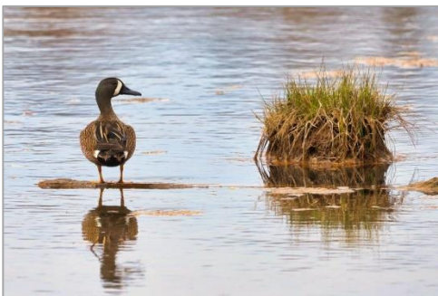
Blue Winged Teal