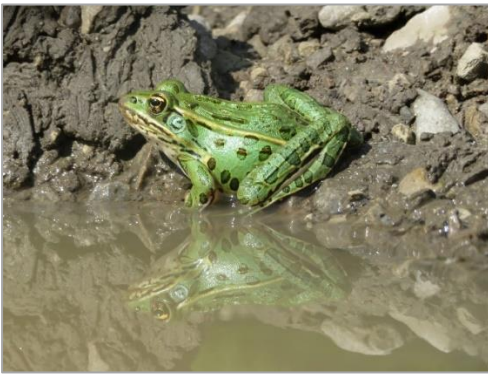
Northern Leopard Frog

Every month we will highlight our favourite images and issue prizes for fun, educational or inspiring contributions